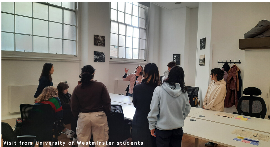
Visit from University of Westminster students

Updates from Barts Health NHS Trust Archives